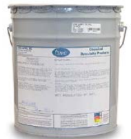
5 GALLON PAIL